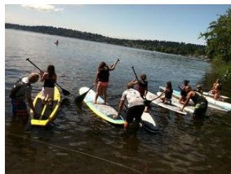
Kids get ready for the 'Paddle Sprint' at the inaugural Stroke the Slough race.